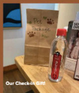
Our Check-In Gift!

I've always considered Houston fortunate to have Austin and vice-versa. Why? Because both cities are so uniquely different that traveling to either one gives you a total different experience, which is what a vacation should be! For Houstonians, traveling just 2.5 hours by car to the Texas capitol and beautiful sights of the hill country is the perfect getaway (and definitely less hassle than air travel during these pandemic times). Plus, the big bonus is that you can take your pet along, making the trip even more fun and memorable.