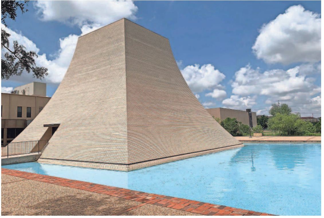
The Museum of Texas Tech University is a museum of everything — art, sports, natural history, local history, anthropology, paleontology, photography, you name it. Its vast spaces consist of much more than this mesa-like constituent planetarium.