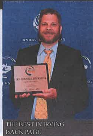
THE BEST IN IRVING BACK PAGE