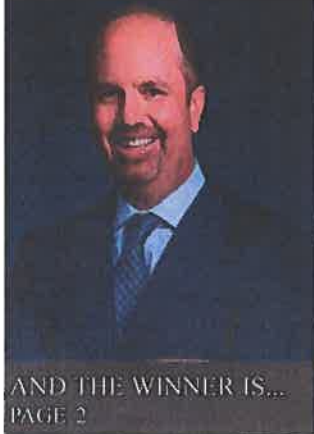
AND THE WINNER IS... PAGE 2