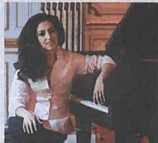
LAS COLINAS SYMPHONY PAGE 7